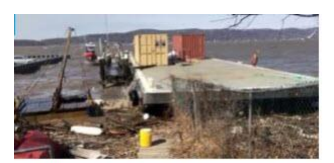
The runaway barge (seen here alongside Irvington Boat Club's pier) smashed into and damaged the pier during a storm on May 2, 2018.